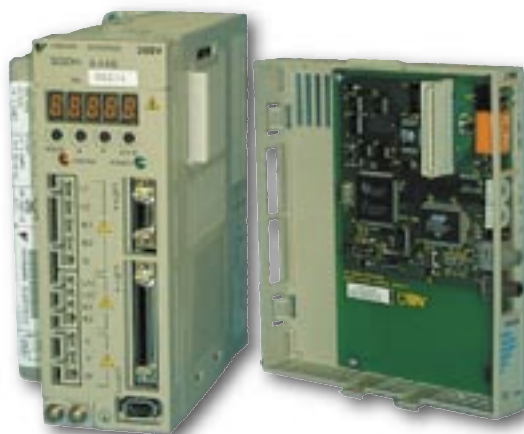
Module simply clips to any suitable Yaskawa Drive